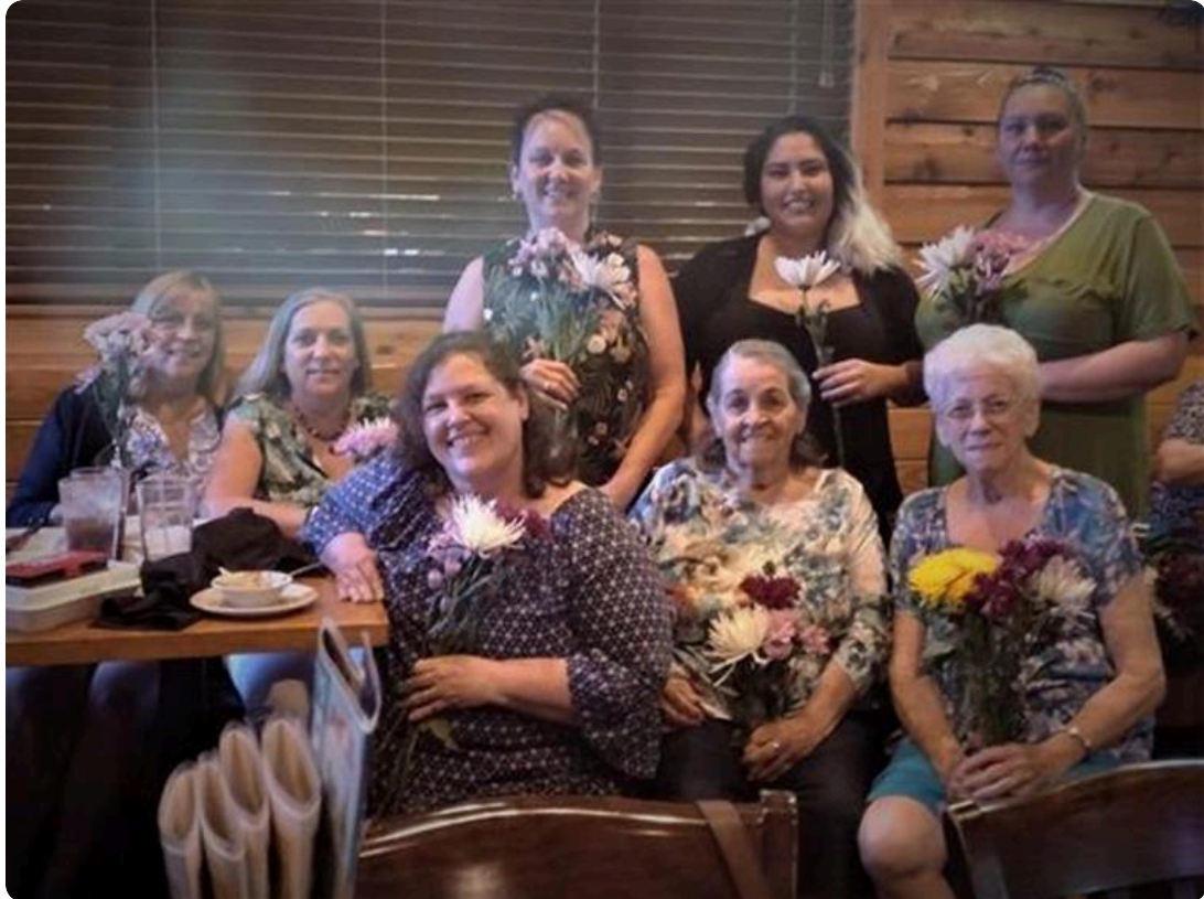
Mother's Day 2021